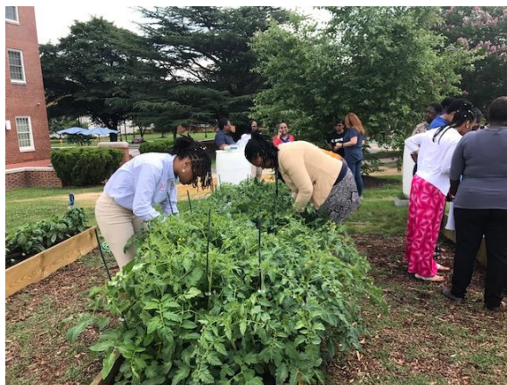
Above: VSU urban community garden participants

Nearly 75% of the U.S. population resides within 200 miles of a city representing potential customers for produce and livestock products grown on urban farms. A USDA survey of 315 U.S. urban farm producers cited their greatest training need was achieving and maintaining business profitability. The survey determined there was a lack of available educational training to assist urban farm producers in being profitable. Virginia Cooperative Extension educators and Master Gardener program volunteers may be inadequately prepared to confidently teach growing urban farm audiences how to start and manage a successful urban farm business.