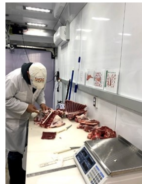
Above: MSPU butchering