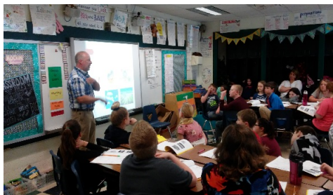
Above: Teaching indoor growing lesson

In the United States, more than 800 million people live each day uncertain where their next meal will come from. In Virginia, more than 893,000 people do not have reliable access to affordable and nutritious food in sufficient quantity for healthy mind and body system development and maintenance. This condition of uncertainty in food accessibility is termed as “food insecurity” and is related to income and geographic location. In the rural mountain area of Carroll County, Virginia, nearly 60% of the total student population of Carroll County schools is eligible for free and reduced lunch demonstrating a potential need for educational opportunities to train youth how to grow their own food, so that they can help improve their family’s access to fresh, affordable foods.