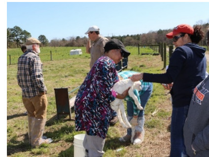
Above: Pasture lambing techniques

Hair sheep are a growing segment of the U.S. small ruminant industry. They are well suited for sustainable, pasture-based production and are a good fit for novice producers. One of the most stressful times for a shepherd is lambing. Many producers do not realize that pasture lambing is an option, especially when necessary to take a lamb and force it onto a foster mother (mothering up). The difficulty with this process is convincing the foster mother to accept the lamb, and then allowing her to feed the foster lamb. In order to reduce lamb losses and cut down on labor and feed demands associated with indoor lambing systems, spring lambing on pasture may be a viable solution. It has been estimated that $25 per ewe is needed to manage a lambing ewe in a barn to pay for feed, bedding, labor and other expenses. Additionally, research showed that barn or shed lambing results in higher lamb loss (15%) compared to lambing on pasture (8%). To address this issue and potential solution, the VSU Small Ruminant Program conducted research and outreach to limited-resource, small-scale and socially disadvantaged lamb producers on the benefits and techniques of spring lambing on pasture.