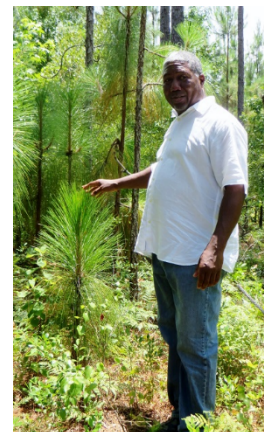
Right: African-American forest landowner

Many of African-American and other underserved landowners are selling their precious timber resources without the assistance of a consulting forester. Without the proper knowledge to inform their timber cutting decision, many underserved landowners receive only a fraction of their timber's true value. For this reason, it is vital to seek out and provide trusted counsel from 1890 institutional forest management professionals who have their best interests at heart.