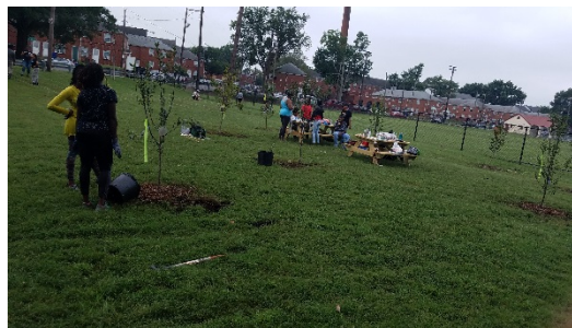
Above: Gilpin Court fruit tree garden

for daily meal consumption. Without inclusion of often expensive fruits and vegetables into a daily diet, Gilpin Court residents are at a high risk for obesity.