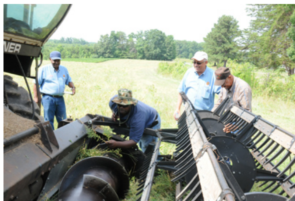
Right: Teaching farm equipment repair workshop

Small farmers in Virginia face several barriers that limit their ability to successfully operate a profitable farm business. Such barriers are, but not limited to: 1) lack of knowledge of USDA programs and services, 2) limited access to credit and capital, 3) lack of skills in farm business and financial planning, 4) lack of knowledge of improved production practices and 5) limited access to existing and viable markets.