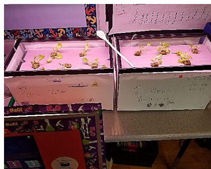
Above: Indoor growing experiments

Carroll County has seven elementary schools. Four of the elementary schools have an outdoor school garden. The three remaining elementary schools do not have a dedicated outdoor space or volunteers to manage an outdoor garden. These three schools that do not have an existing outdoor garden expressed interest in exploring growing indoors using hydroponic methods in their classroom. In 2019, the VCE Greenhouse Program at VSU, utilizing a $500 Ag in the Classroom grant award, was able to establish three elementary school programs to teach students and teachers how to grow indoors using hydroponics, aquaponics and aeroponics methods. Student activity books were provided that included a weekly plant growth journal for students to use to track their plant’s growth. In addition to the classroom hydroponics setup, teachers were also provided with seeds and starter trays to get their plants germinating. Students maintained the fertilizer concentration in the grow tank and monitored the pH level of the water to maximize the health of the plants. Students also created a trellis structure in the classroom to support the vines on their bean plants.