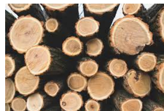
Right: Harvested timber

In collaboration with the VSU Small Farm Outreach Program, the VCE Forestry Management Program at VSU conducted four workshops to train participating landowners how to select a consulting forester and how to sell their timber for maximum value.