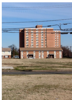
Above: Gilpin Court

Gilpin Court is the largest public housing community in Richmond, Virginia. Eight hundred families, mostly single mothers raising children with an average annual income of $8,786, live within the impervious concrete walls of 77-year-old structures overlooking a tree barren landscape. Gilpin Court is geographically isolated despite being “in the heart” of culturally vibrant Richmond city. Bordered on the south by a highway and on the north by a ravine, low income residents of Gilpin Court have restricted access to healthy foods, such as fruits and vegetables. With a lack of easily accessible grocery stores, underserved residents rely heavily on prepared, highly processed convenience store foods