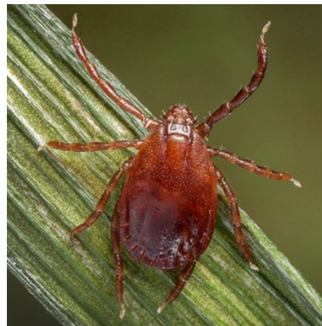
An Asian longhorned tick

If you find a tick, the CDC recommends the following steps: remove it as quickly as possible (VCE recommends using fine-tipped tweezers); save the