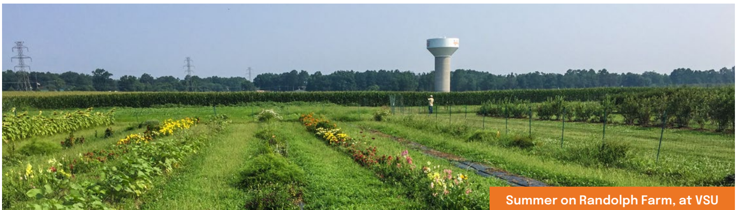
Summer on Randolph Farm, at VSU